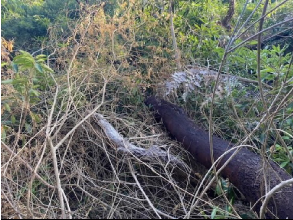
Site photograph 1: Disturbed vegetation North of the burst pipe location

In the vegetated area, the ground surface was dry, but evidence of potential recent disturbance and inundation was noted in the form of collapsed trees that appeared to have fallen recently due to the condition of the attached foliage, and also areas of migrated sediment were present.