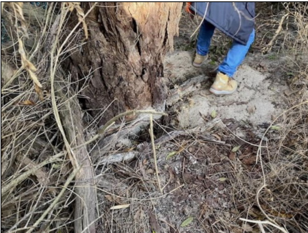
Site photograph 2: Example of recently deposited sediment, North of the burst location