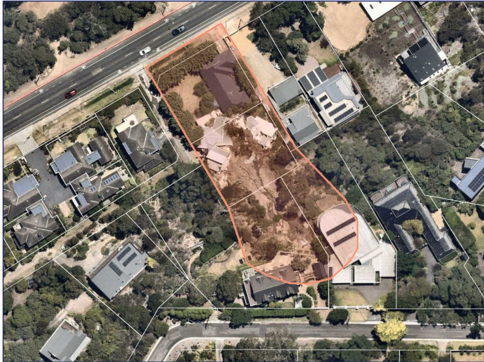
Inset 2: Area requiring in person critical monitoring and inspection highlighted in orange.