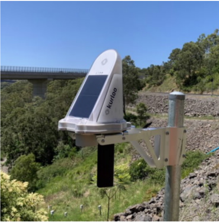
Figure 1: Example of GNSS Sensor installed on steel post