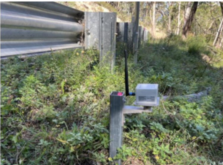
Figure 2: Example of tilt sensor installed on steel post