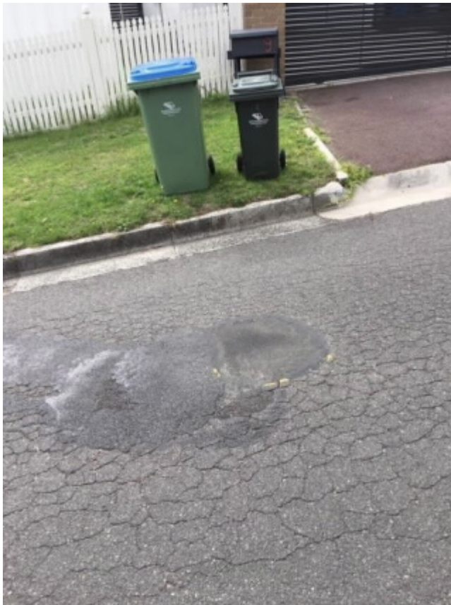
Photo 11 Generally looking at Coburn Avenue I believe the road surface is in relatively good condition except for the few areas identified in the attached photos.

Looking at Coburn from Point Nepean Road uphill towards Burrell Street there is a large patch of While there is some surface cracking and some minor undulation in several areas, if residents consider this road is an example of poor condition, they must have very good roads around this area, or they expect very high standards. cracking and signs of subsurface material starting to pump through the pavement surface. This area needs attention. See Courtney from DM Roads comments on maintenance at that location below.